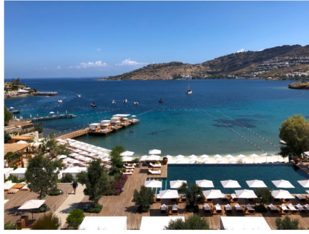
All of the terraces overlook Yalikavak Bay, one of the most charming corners of the Turkish Turquoise Coast.