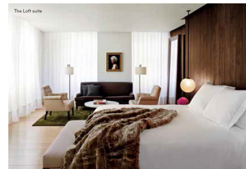
The Loft suite

If not shopping, which is unlikely, you'll definitely be eating – and where the city itself offers unlimited dining options, the hotel is home to one of the best. Helmed by celebrated Michelin-starred chef Jason Atherton, Berners Tavern is a hot-spot for Londoners and visitors alike, who enjoy great drinks and a menu loaded with English grub made fancy, in the debonair surroundings of the Ian Schrager-created space. Editionhotels.com/london