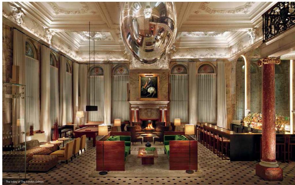
The lobby of The London Edition