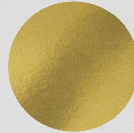
Fig 2. T R A N S L U C E N T