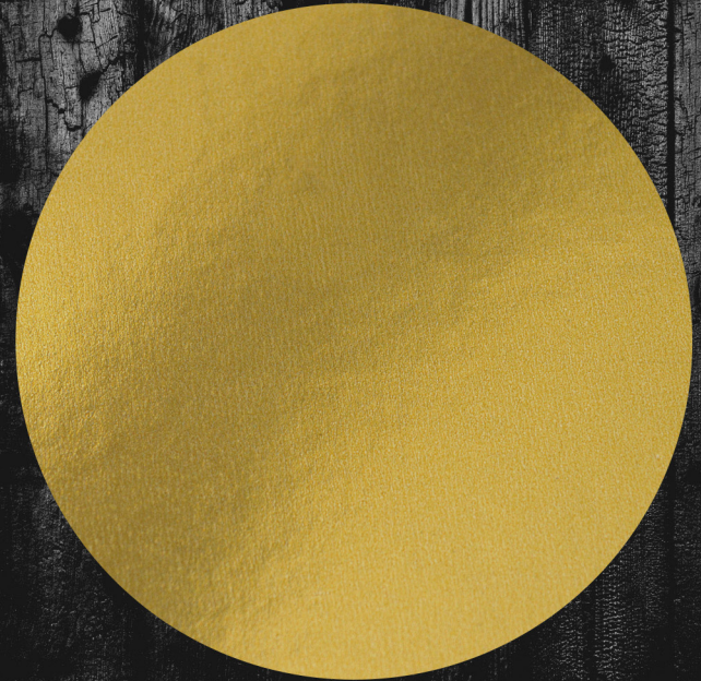
Fig 1. OPAQUE

Embrace shadows and silhouettes that barely skim the surface. Take the plunge to uncover what lies beneath.